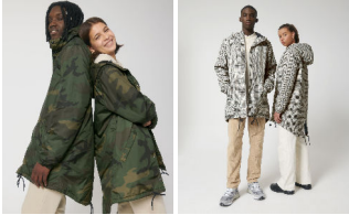
Padded Parker AOP Padded Parker Tweed

Shell : Plain Weave , 100% Gerecycled polyester , Fluorine-free DWR , 75 GSM Padding : 100% Gerecycled polyester , 100 GSM Lining : Taffeta , 100% Gerecycled polyester , 75 GSM